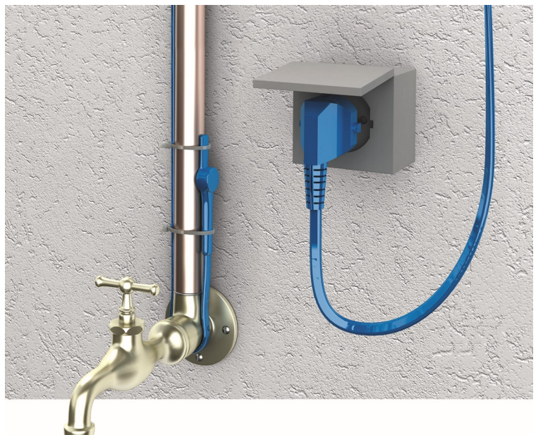
In Accordance with NF C15-100